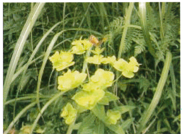
Plant of endengered specie