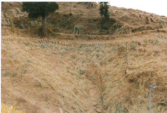
After chakusa harvest