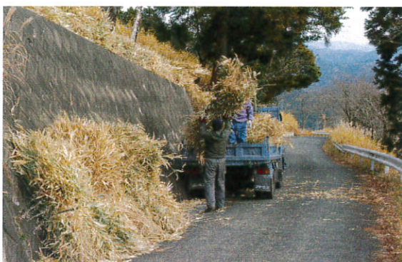
Transport dried Chakusa