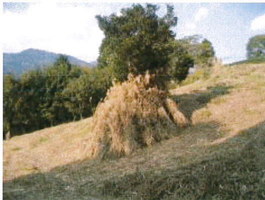
Drying harvested Chakusa