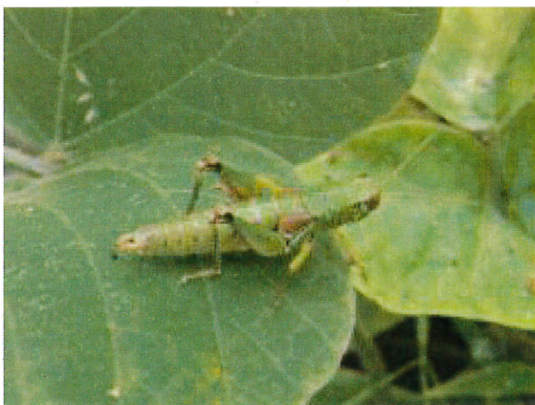
Grasshopper of endengered species level