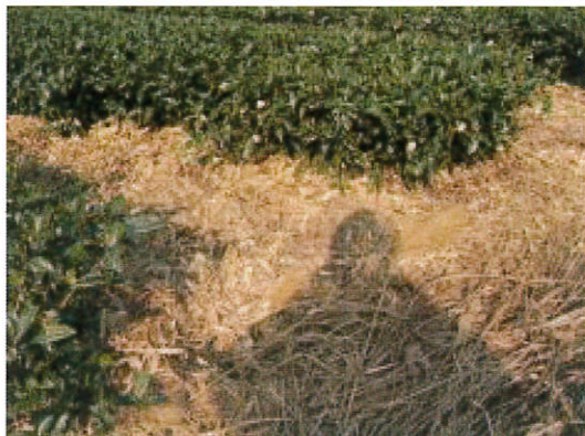
Inject Chakusa between tea trees